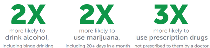
Figure 1. High school students who have experienced a major depressive episode in the past year are more likely to use alcohol, marijuana, and prescription drugs.

Data source: Healthy Kids Colorado Survey, CDPHE, 2017